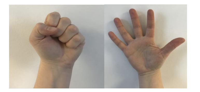
2. Thumb and finger opposition.