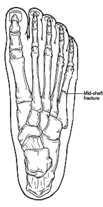
Figure 1 shows where the break is in your foot

You have fractured a bone on the outer part of your foot (see figure 1). The fracture has occurred in a part of the bone which normally heals well without problems.